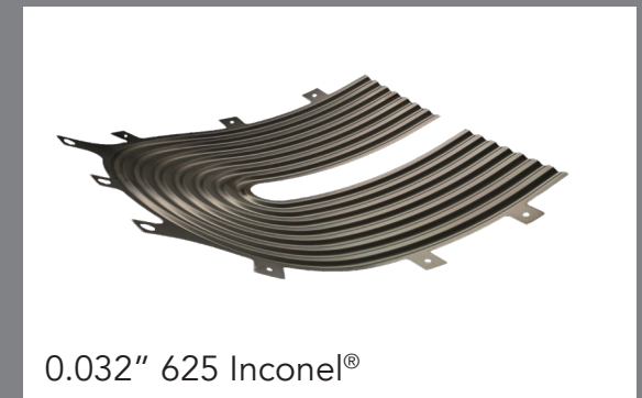
0.032" 625 Inconel®

Stampings are trimmed using 5-axis laser cutting or machining to produce more precise parts