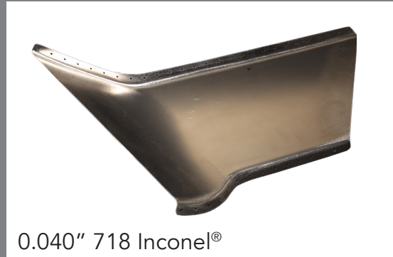
0.040" 718 Inconel®

Our goal: To shape the future of mobility