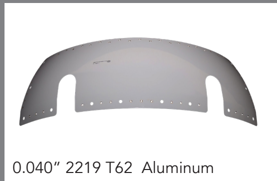
0.040" 2219 T62 Aluminum

Our complex processes allow the forming of difficult alloys such as titanium, stainless steel, Inconel®, and aluminum